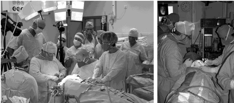
Figure 2: Two different maxillofacial interventions. Such long-lasting procedures may be offered to students via detailed education documentation.

Ten HD video cameras were installed together with large screen LCD displays across the clinic in the next step of the project realization. Using network infrastructure the cameras send content to the server that distributes it to the co-workers' workplaces and/or archives it at the same time. This ensures that the records will be available for later usage in education processes. Other ten intraoral cameras were installed at the dental chairs. These allow us to see details in the mouth of patients through dental chair LCD panels. Video content obtained from these cameras can be stored on network storage system that works also as a central unit of the network of these intraoral cameras. In combination of interconnected RTG and viosigraphic unit the clinicians have access to all necessary images and video documents almost immediately it is generated. Except of others, the advantage is that the patient can be treated by doctors that have all the available documentation.